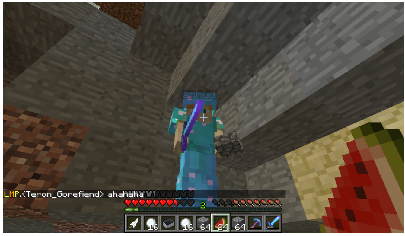
15. Moderator expecting me to be the reason for low tps