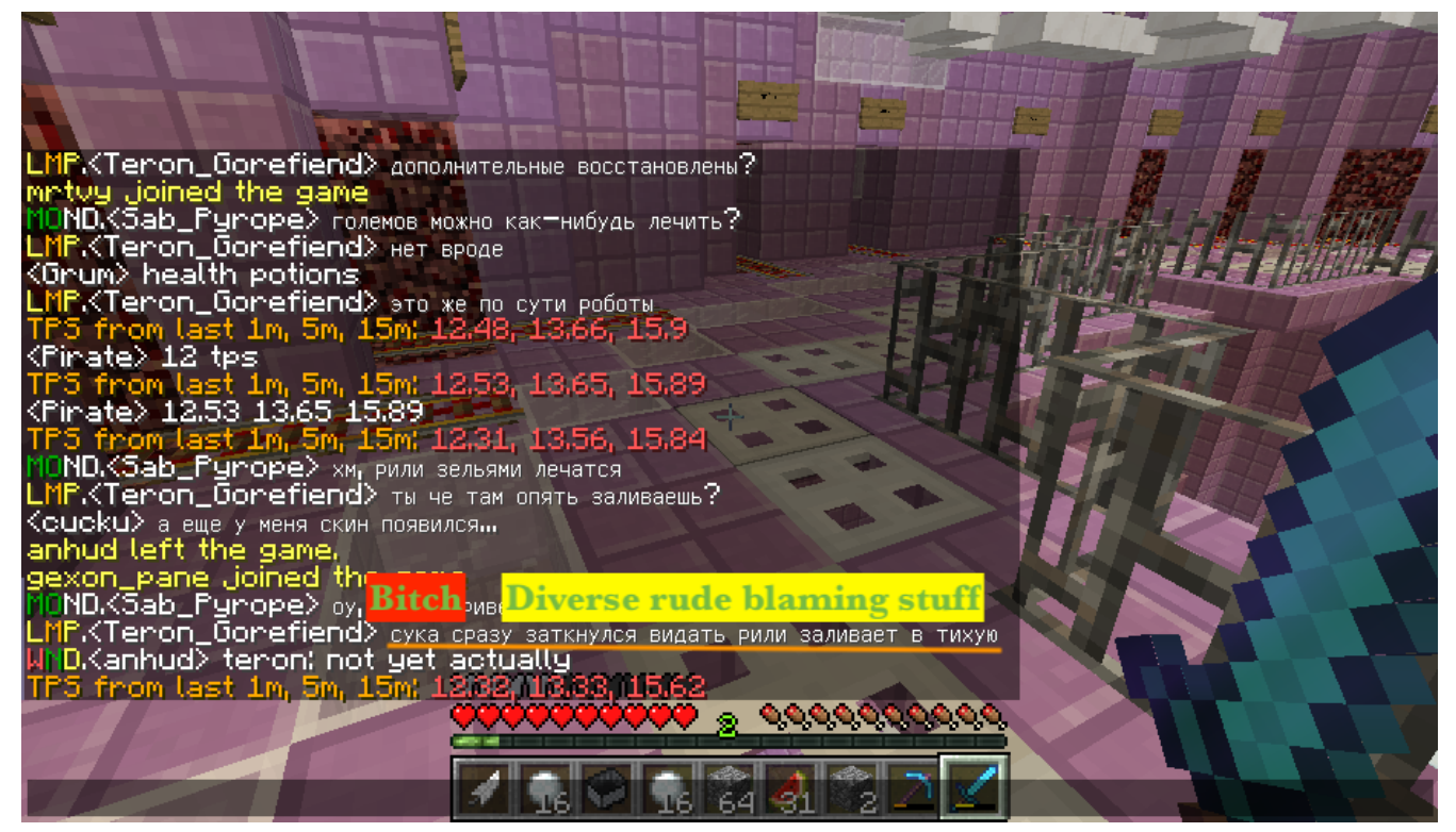
2. Blaming me for stuff I didn't do in a very rude form