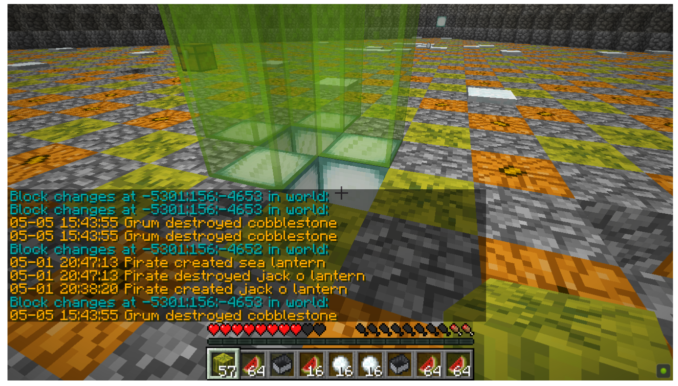
10. Break in and griebing logs