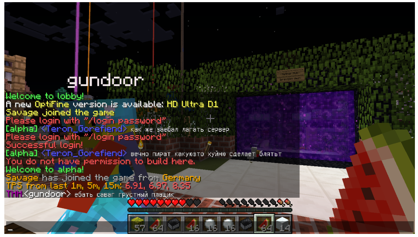
8. Immediate rude insults after ban and tps