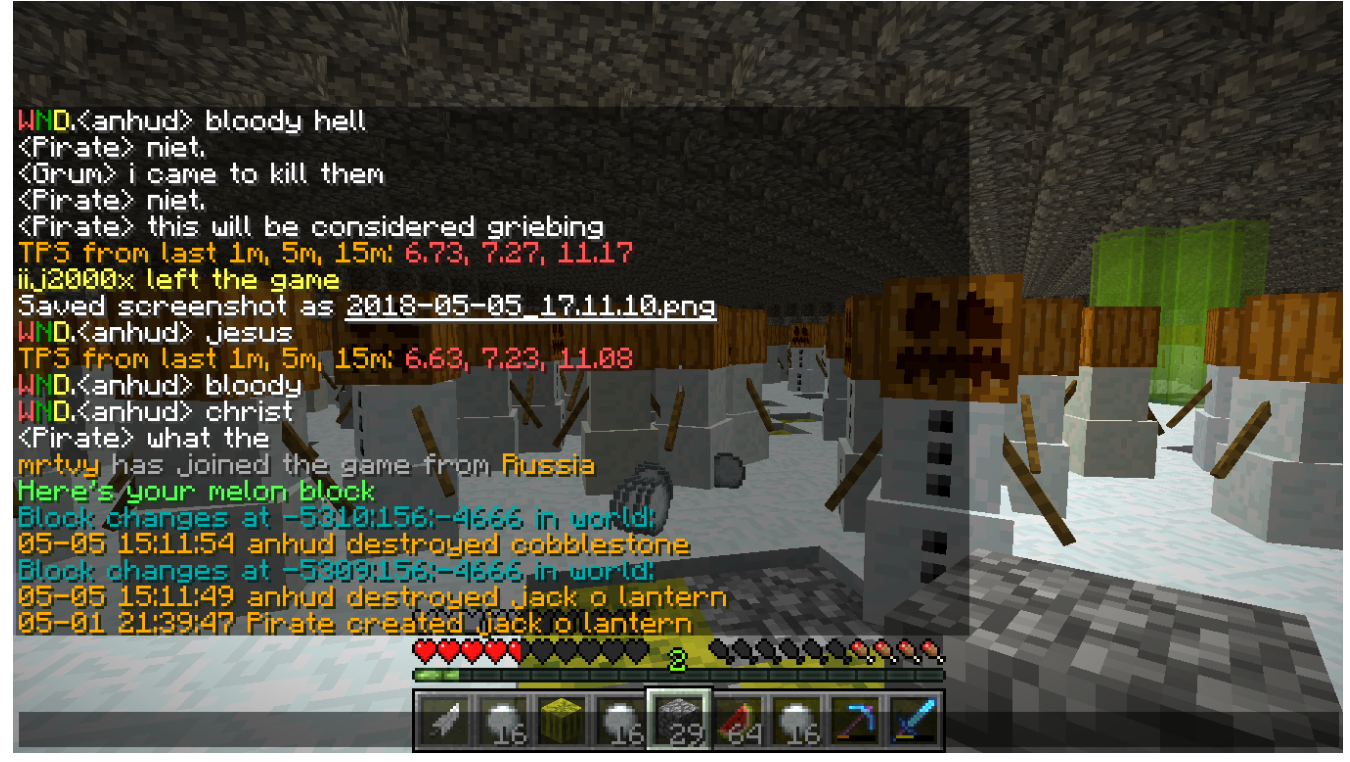
4. Snowballs and break in with TPS values before execution