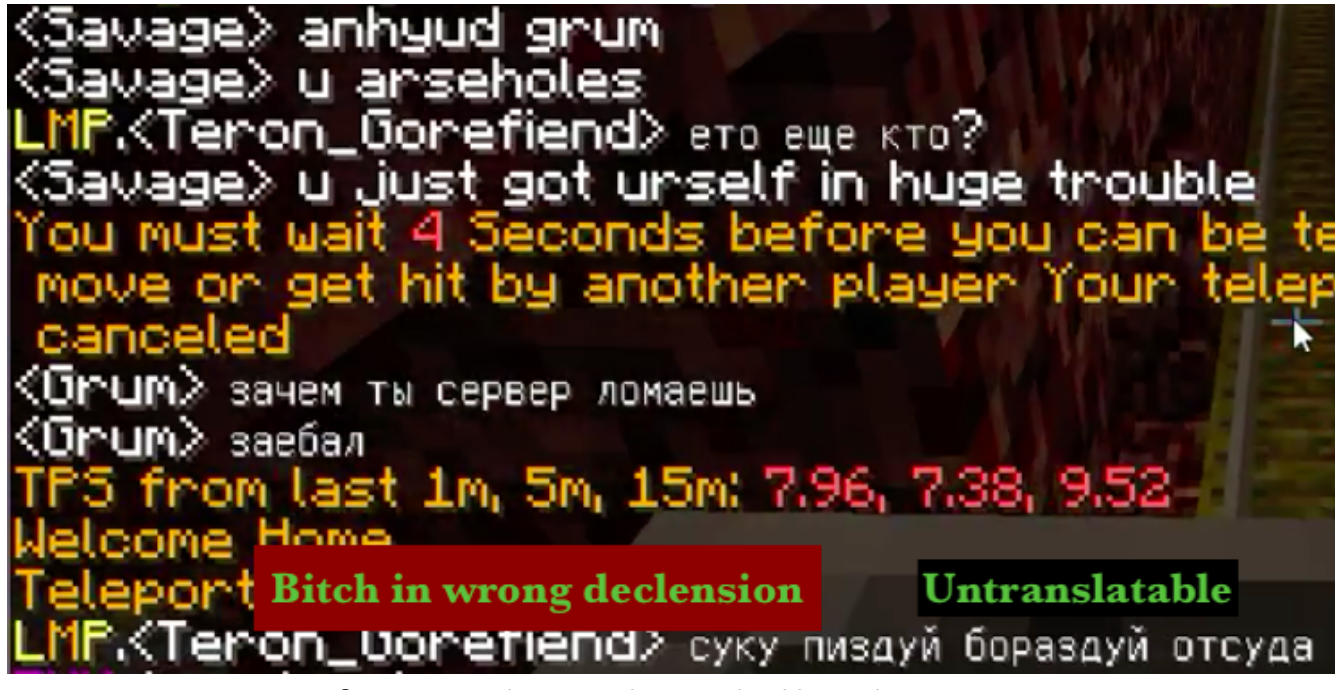
7. Some very rude personal untranslatable insults