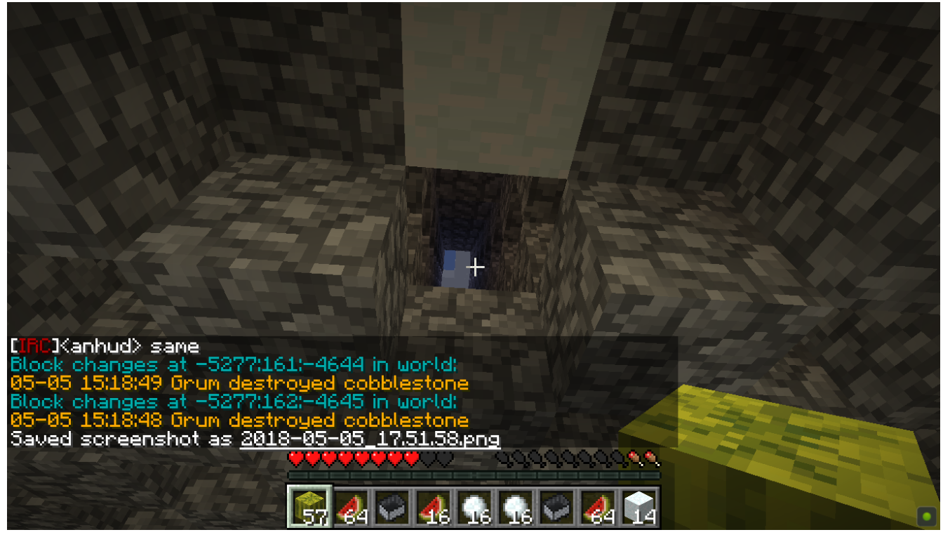
12. Break in and griebing logs