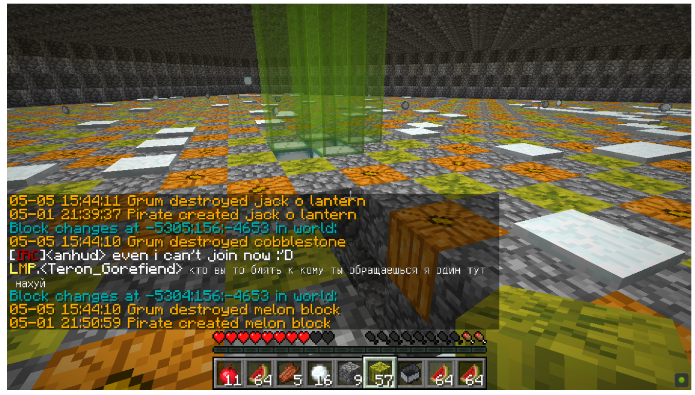
14. Break in and griebing logs