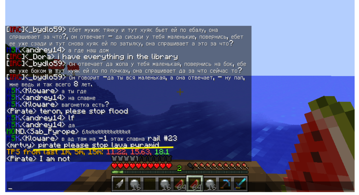
1. Blaming me for stuff I didn't do

Therefore, the snowmen were killed for nothing (or just for fun, as you or someone else may want to express it), which indicates some basic server rules being violated due to this process, which actually involved and was possible executed under a local moderator, someone, who is actually there to make sure the server rules are not being breached, what actually happened on that afternoon, which is totally not cool at all. The following screen shots are mentioned: